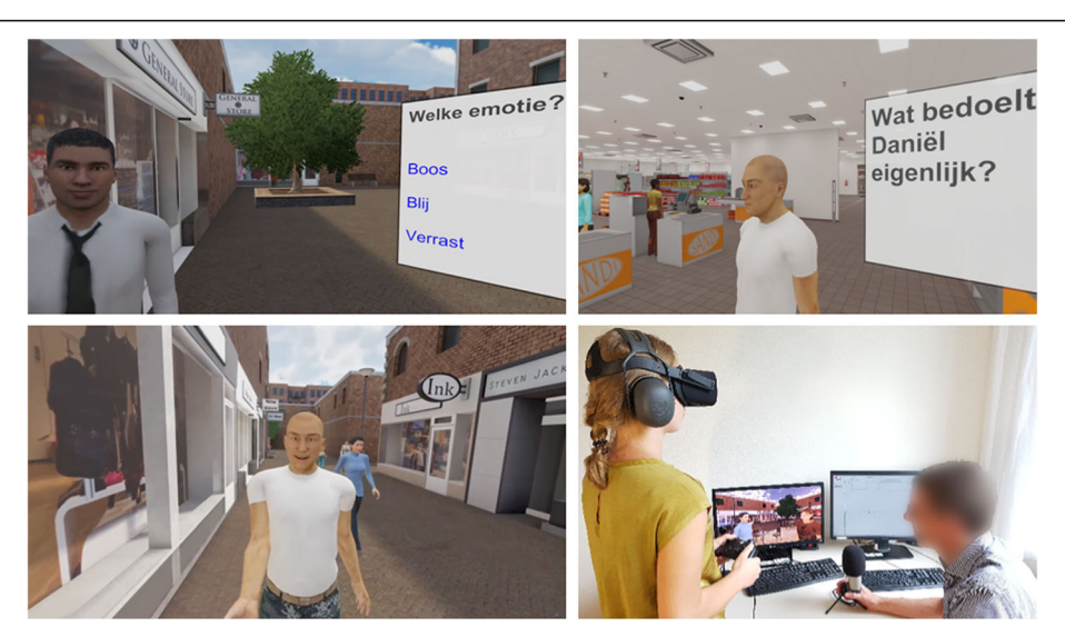
Fig. 2 Pictures of DiSCoVR environments and set-up. Legend: Top left: module 1 (translation: which emotion? Angry, happy, surprised); top right: module 2 (translation: what does Daniël actually mean?); bottom left: module 3, as seen from perspective of participant; bottom right: module 3, interactive role play setup. The virtual environments are property of CleVR BV

Nijman et al. BMC Psychiatry (2019) 19:272 Page 5 of 11