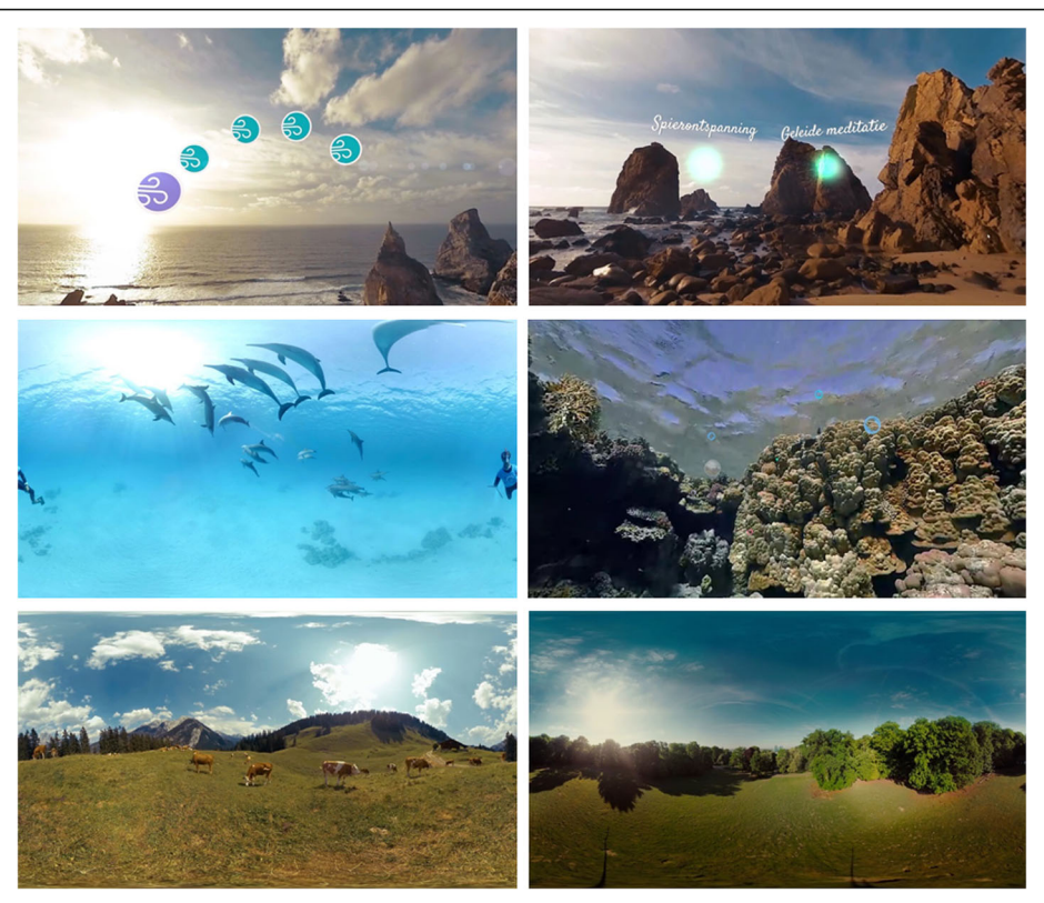
Fig. 3 VRelax environments, including relaxation exercises. The virtual environments are property of Viemr BV; images have been used with permission from Viemr BV

Nijman et al. BMC Psychiatry (2019) 19:272 Page 6 of 11